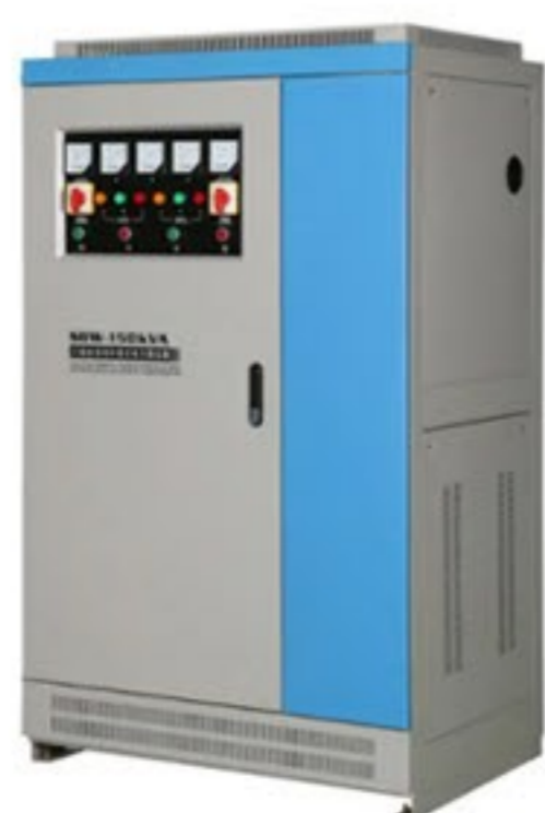
Industrial Power Supply