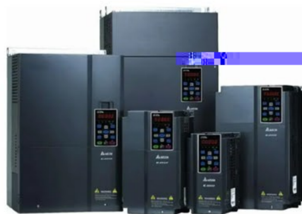
Industrial Variable Frequency Drive